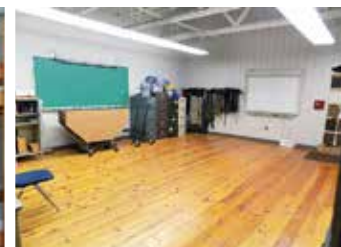
One of the classrooms