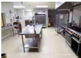
Commercial grade kitchen