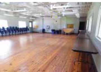
Large meeting/dining hall