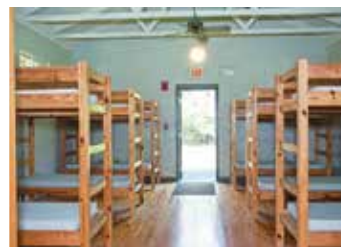
One of two dormitories